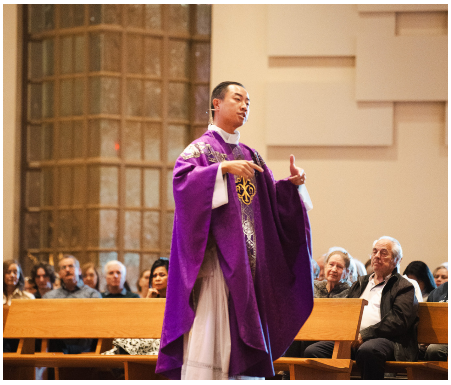
February 4, 2024 | Fifth Sunday in Ordinary Time